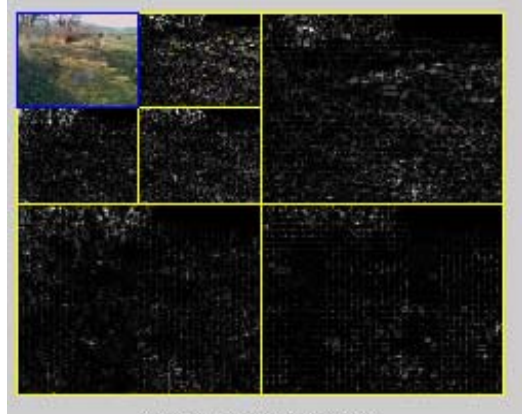
Decomposition at level 2 ImageA

Fig.2 shows an experience, which is done in this research. Image A is the background image (without smoke), and Image B shows the background image with smoke. Wavelet energy is clear in both images. Two steps wavelet were executed in this experience and the wavelet analysis operation was applied for both steps. The results of the calculation are showed in table 1.